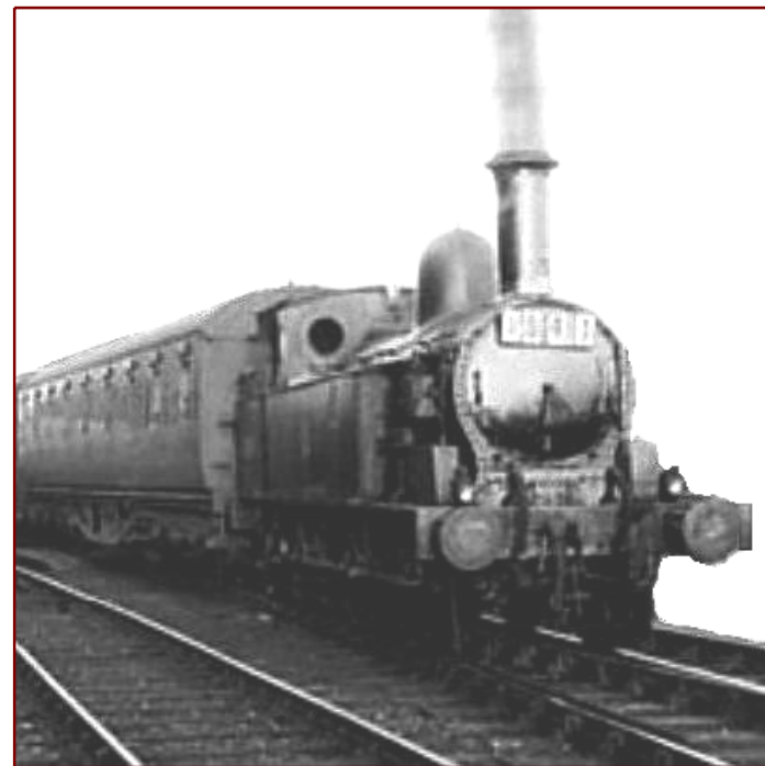
'Nobby', a steam locomotive that pulled the train on the route from the 1950s, seen here with its two 'motor' coaches.

The branch railway line from Wolverton to Newport Pagnell opened to goods traffic in 1866 and to passenger traffic in 1867. It closed to passenger traffic in 1964 and to freight in traffic in 1967. After the rails of the single-track line were lifted, and the station buildings sadly demolished, the route was converted into a cycle track – Redway 6; at least the original bridges and platforms were left behind! In a number of places, the line was visibly cut through Jurassic rocks. These were formed in a gradually shallowing tropical sea about 170 million years ago. This geotrail shows you where you can see these rocks and gives other information about the geology of the route of the old railway.