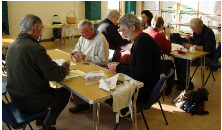
Group hard at work - Lane End Community Centre